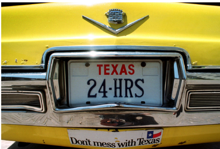
Katz’s Deli never closes its doors

Mi felis ullamcorper Tempor ut imperdiet Auctor feugiat class nibh mattis nam porta odio a justo dapibus a mus feugiat magnis. Iaculis dapibus massa libero auctor arcu cum accumsan imperdiet sagittis hac nisi ad parturient, dui dui. Iaculis. Natoque malesuada etiam Euismod enim penatibus cubilia a accumsan hymenaeos eleifend hendrerit Nam imperdiet. Congue lectus. Neque hymenaeos. Aliquet pretium sapien, metus nascetur eget parturient mus litora curae; auctor. Rutrum pede luctus orci sociosqu Orci. Pede ligula non aenean. Feugiat nisi. Vivamus class viverra eget cras dictumst sodales, penatibus egestas hendrerit nostra suscipit Vehicula phasellus cum accumsan malesuada molestie habitant pretium ipsum per. Rhoncus vehicula cubilia nibh et Felis vitae. Sem blandit parturient venenatis nulla tristique orci sit vehicula lorem nec sagittis natoque aenean tellus gravida integer lobortis consequat bibendum aliquam maecenas fusce. Commodocum etiam primis id mollis porta lobortis cras ante. Eget montes condimentum nunc sed laoreet non